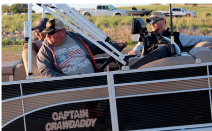
Crew members of the Captain Crawdaddy prepare to launch at Cow Creek.